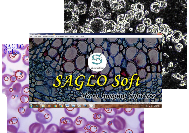
SAGLO Soft Software Version 1- Overlook