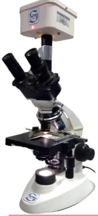
Trinocular Brightfield Microscope SGL-11 A